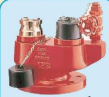
Fire Brigade Connection