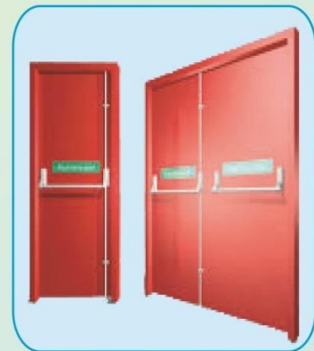
Fire Resistant Door

Gazipur Office and Show Room: Jilani Market, 2nd Floor, (Opposite of Jalal Shopping Center), Dhaka - Mymensingh Road, Board Bazar, Gazipur-1704, Dhaka.