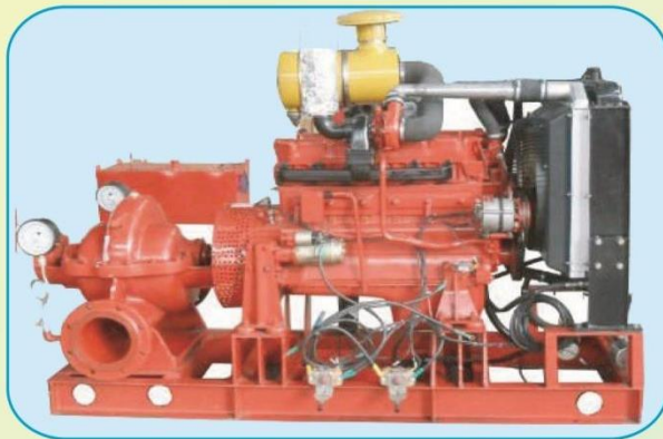
Engine Driven Fire Pump