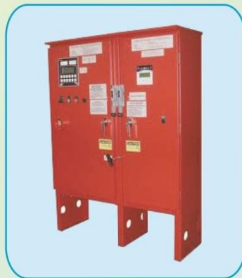
Fire Pump Control Panel