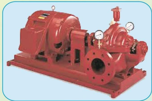
Electric Driven Fire Pump